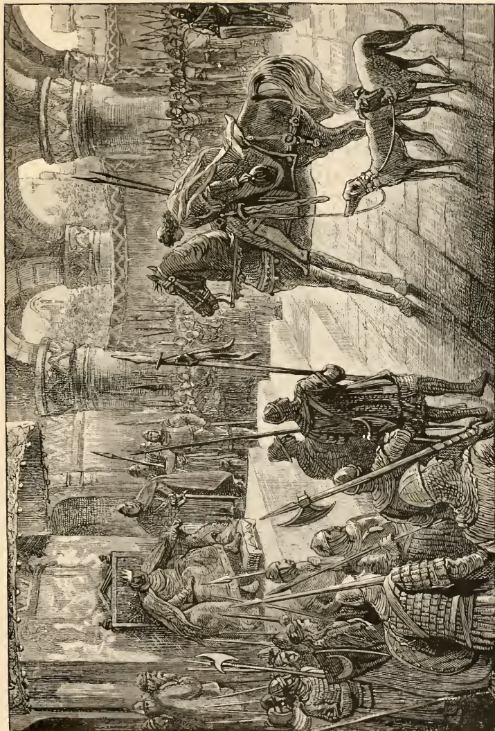
Kilhwch Riding into Arthur's Hall.